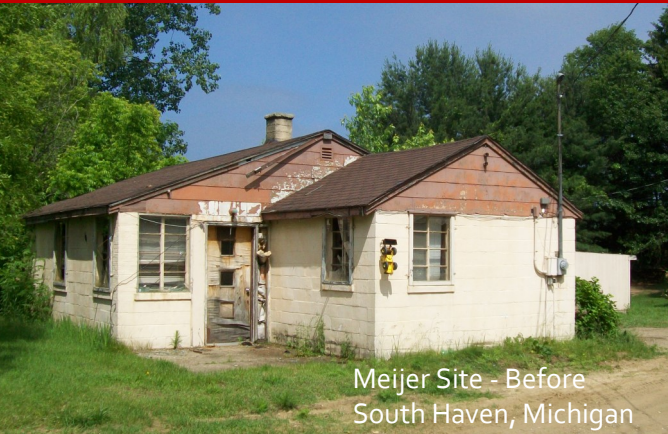
Meijer Site - Before South Haven, Michigan